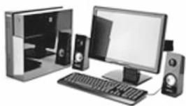
Figure 1: _____