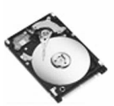
Figure 2: _____