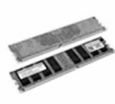
Figure 3: _____